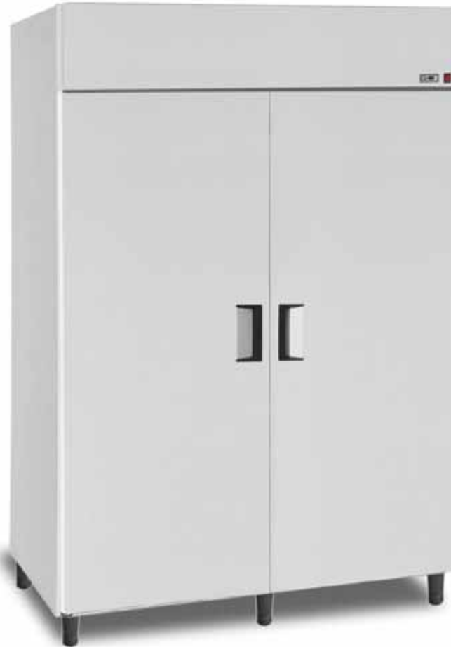
I-Ola P AG M GASTRO*